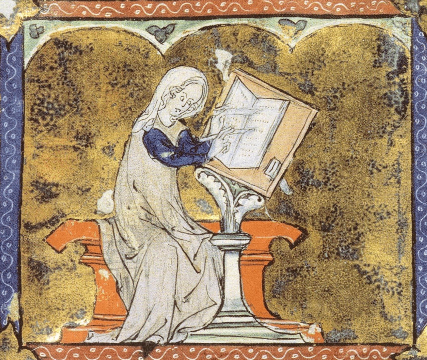
Marie de France