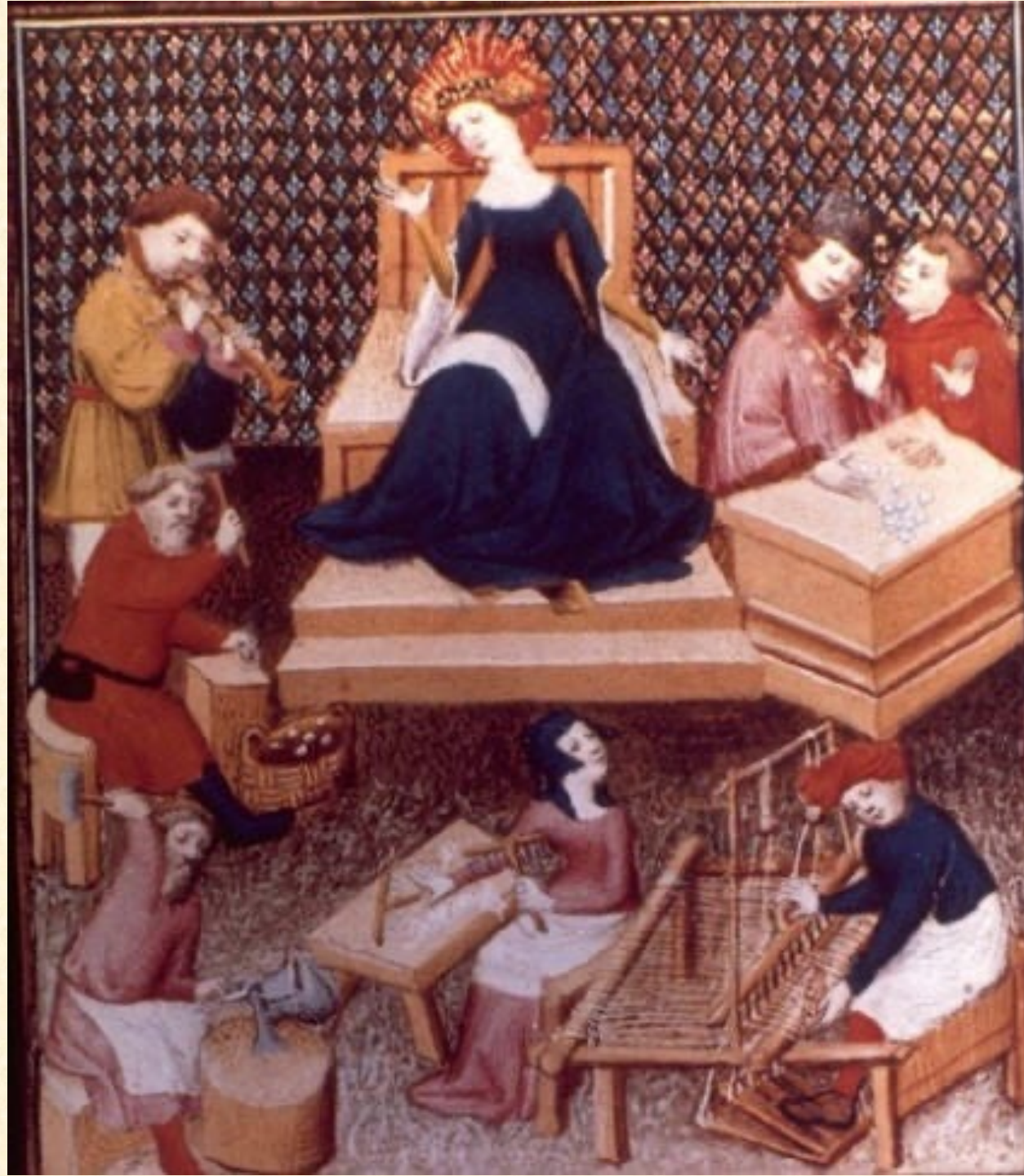
Eleanor of Aquitaine