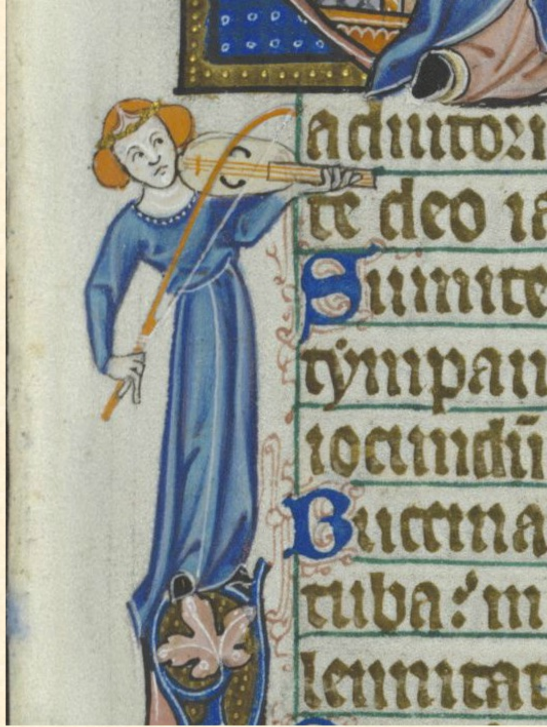
Vielle player, from the Peterborough Psalter