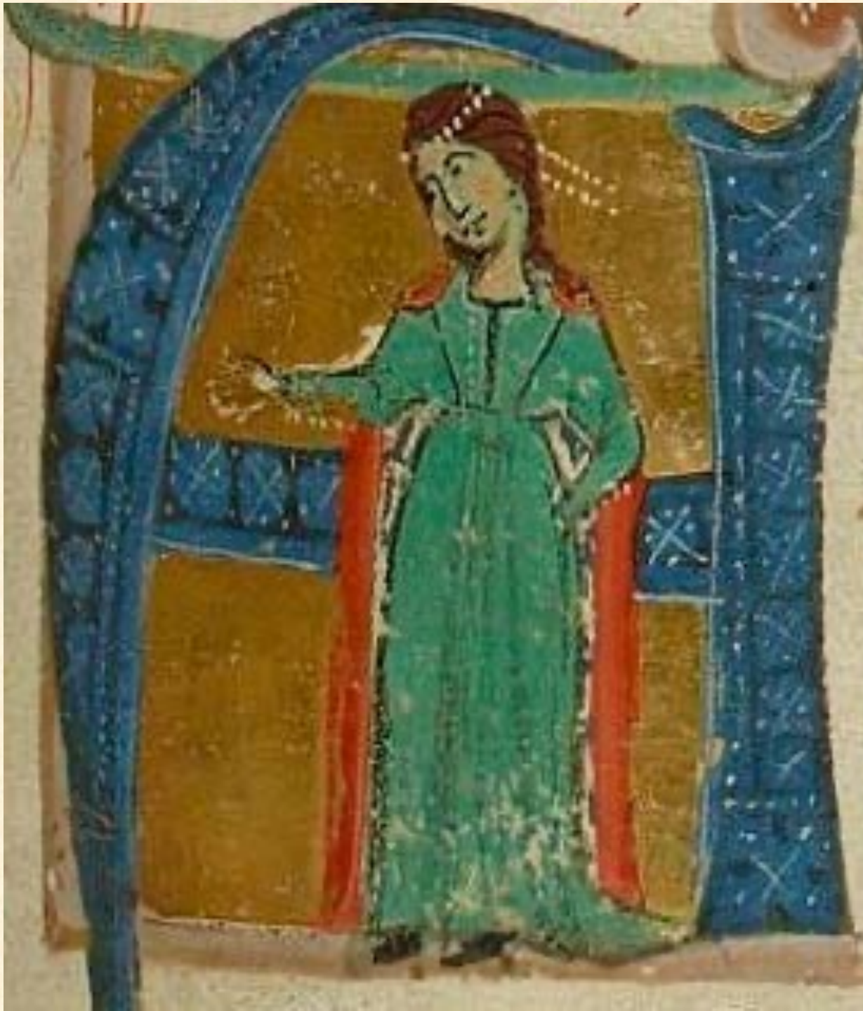
Comtesse de Dia, troubairitz