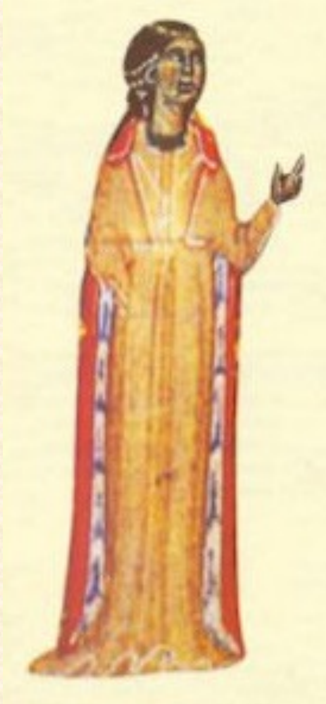
Comtesse de Dia, troubairitz