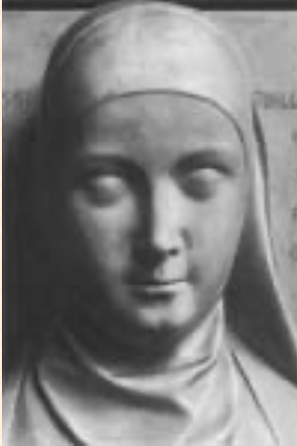
Ermessende of Carcassonne, Countess of Barcelona