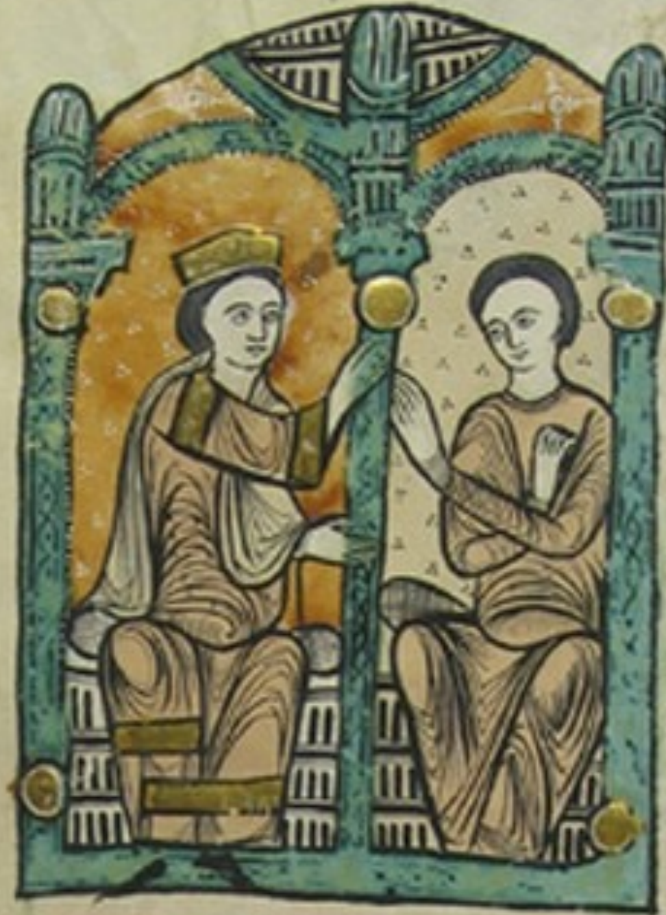
Almodis de La Marche and Ramon Berenguer, Countess and Count of Barcelona