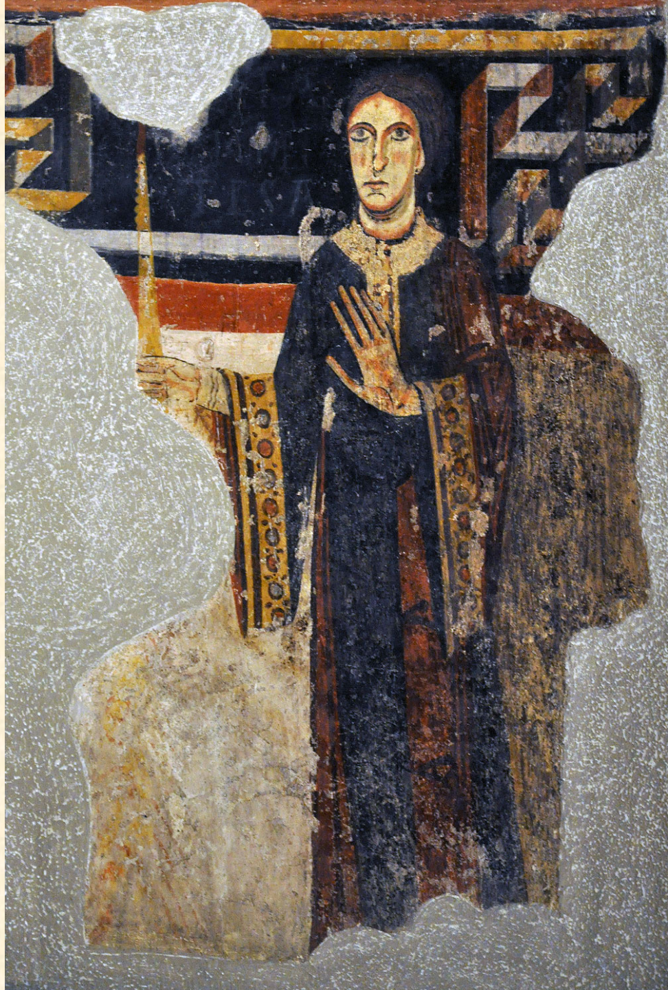
Fresco of Lucia de La Marca, Countess of Pallars Sobira in the Catalan Pyrenees. A replica is in Sant Pere del Burgal chapel, where it was originally situated. The original is in Museu Nacional d'Art de Catalunya in Barcelona.