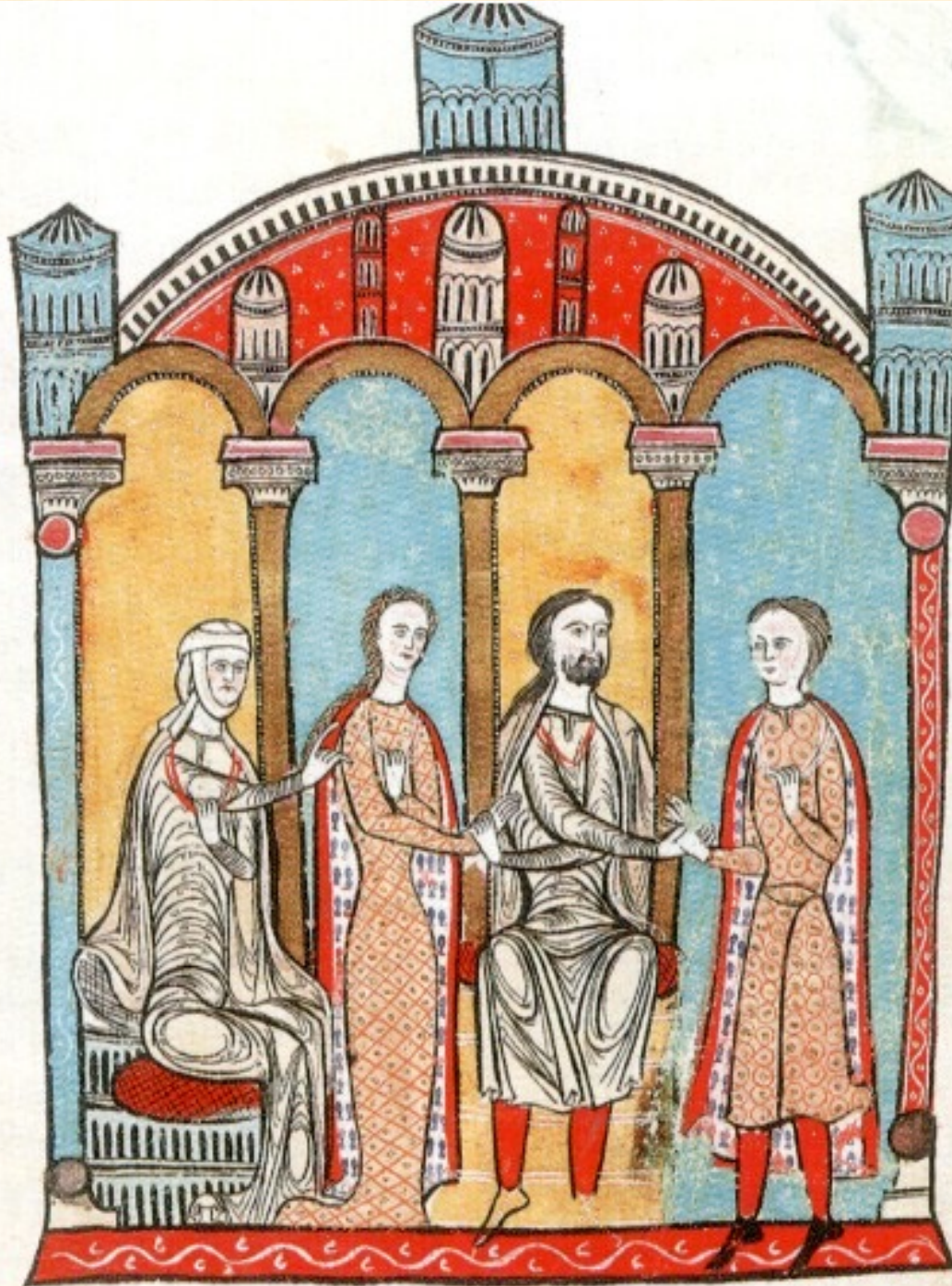
Ermengard, Countess of Carcassonne