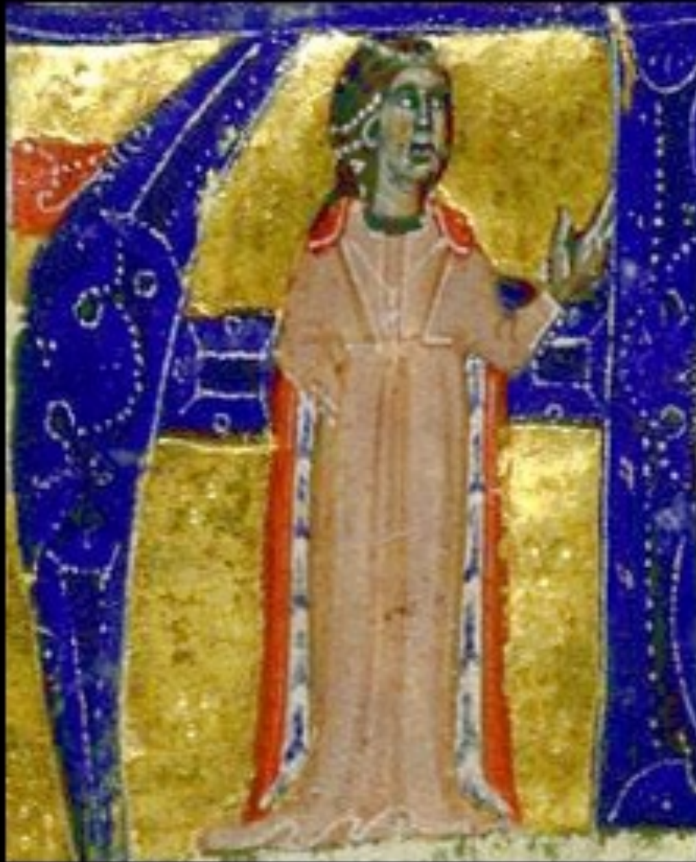
Comtesse de Dia, troubairitz