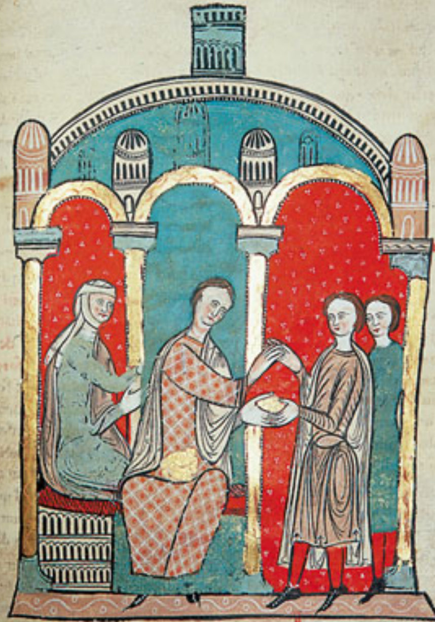
Almodis de La Marche and Ramon Berenguer, Countess and Count of Barcelona